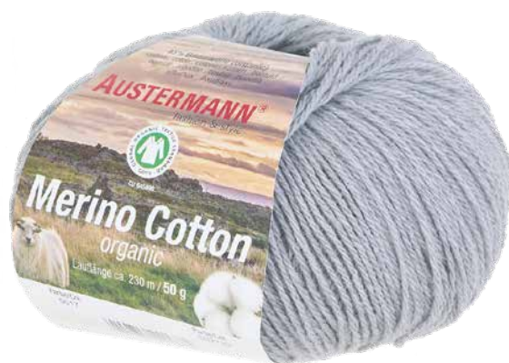
Bild aus Maschen-Style SC 004 Erschienen bei OZ-Verlag